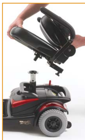
Step 1: Pop off the seat!