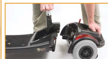
Step 3: Push apart the frame!