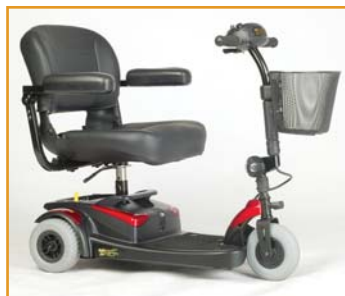
Upgrade to the Stadium Seat!