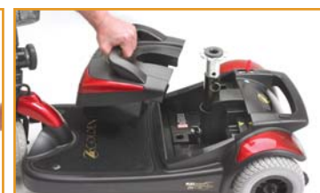
Step 2: Pull off the battery pack!